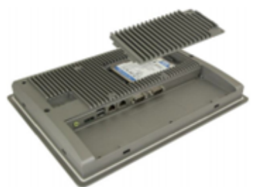
Access to SSD/HDD